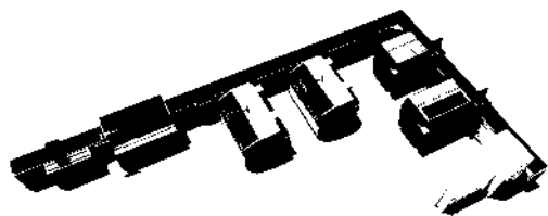
Accelerator a3600 with 2 x Alinityii, 1 x Architect i200SR, 1 x Architect c16000 and third party analysers